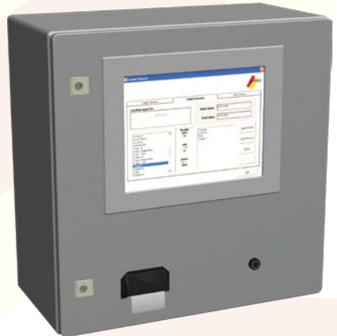
EXAMPLE TOUCH-SCREEN DCS