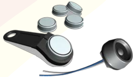
DALLAS i-BUTTON TAGS, TAG HOLDER AND TAG READER