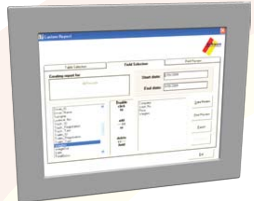
ROC-SOLID TOUCH-SCREEN PC