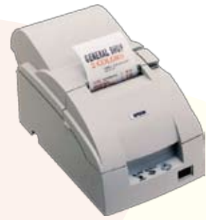
EPSON TM-U220 PRINTER (MOUNTED IN DCS ENCLOSURE)