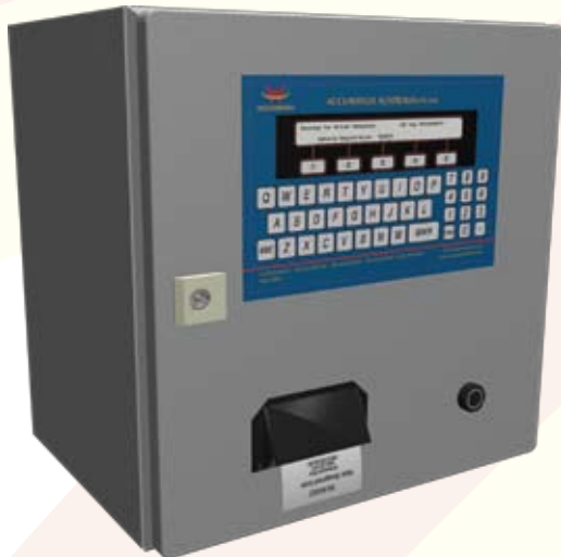
EXAMPLE ALPHA-NUMERIC KEYBOARD DCS

Driver Control Stations streamline your site's operation and workflow, increasing effectiveness and profitability