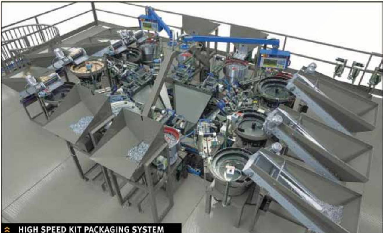
➤ HIGH SPEED KIT PACKAGING SYSTEM