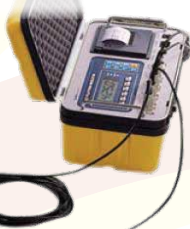
RW-2601P Processing Unit