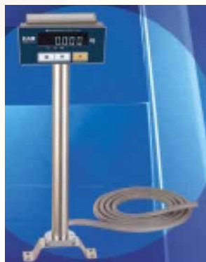
REMOTE POLE OPTION