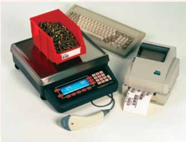
PRINTING AND SCANNING CAPABILITIES