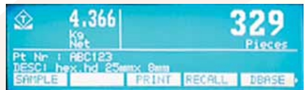
THE G227 DISPLAYS FULL INFORMATION TO THE OPERATOR