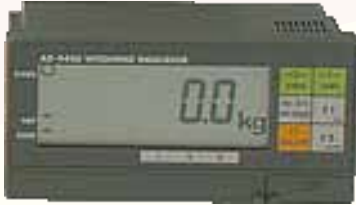
AD-4406 INDICATOR FOR DRY AREA USE