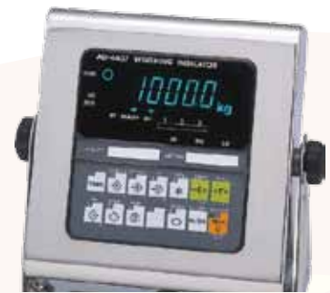
AD-4407 INDICATOR FOR WET AREA USE