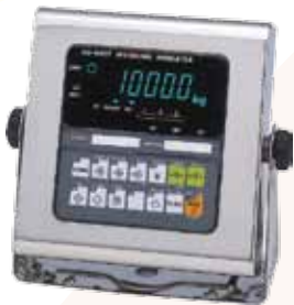
CHOICE OF INDICATORS