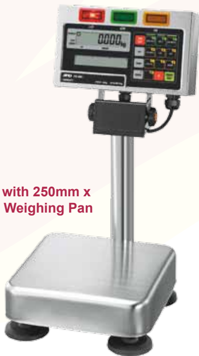
FS-6Ki with 250mm x 250mm Weighing Pan